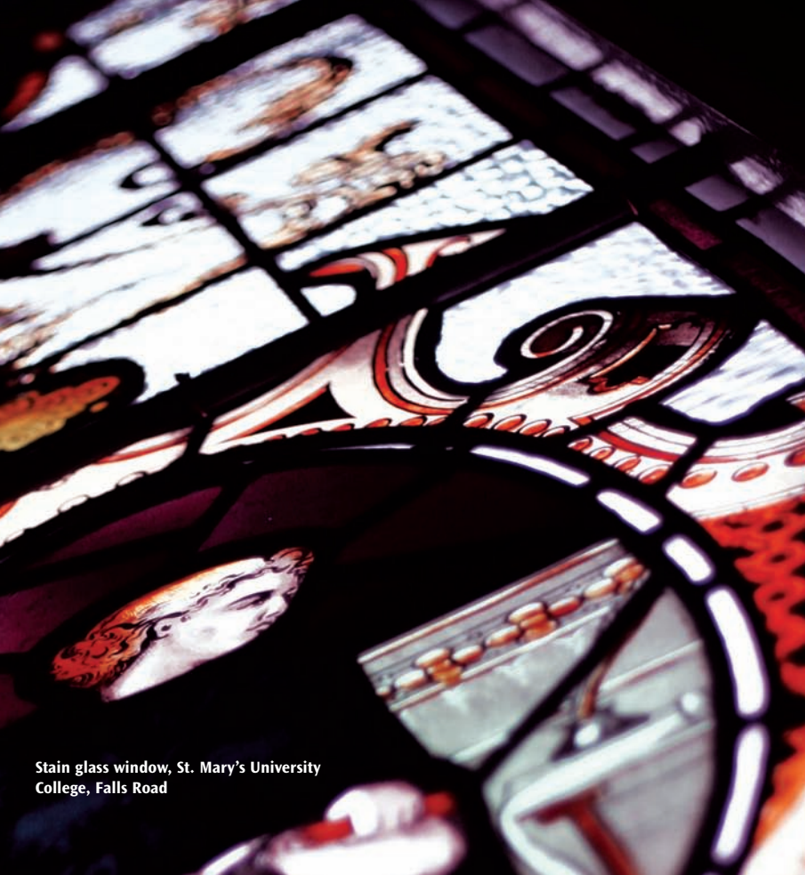
Stain glass window, St. Mary's University College, Falls Road

Is aoibhinn leis an Cheathrú Gaeltachta fuaimeanna: an focal cainte, buille na filíochta, rithim an amhráin, siosarnach an leabhair á oscailt.