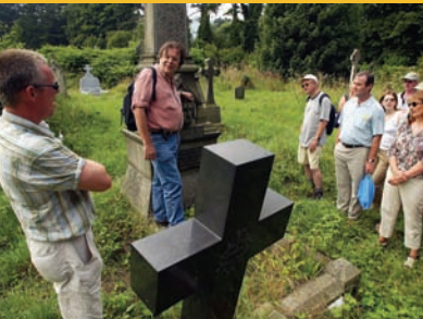
Guided tour of Cemetery