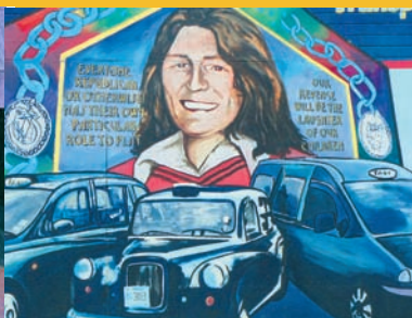
The International Wall