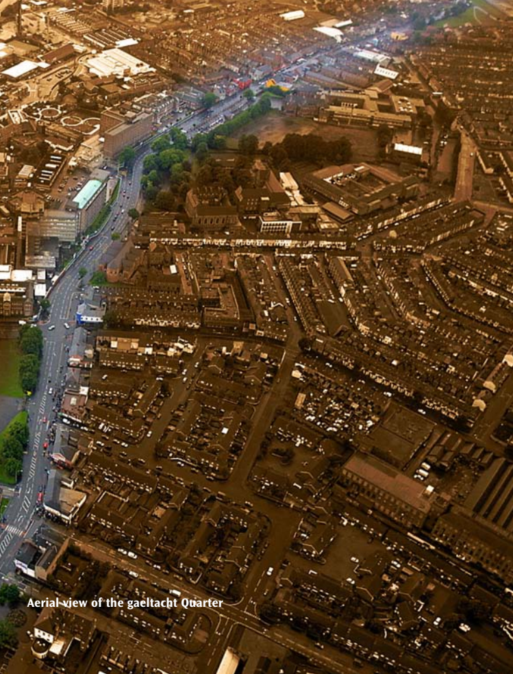
Aerial view of the Gaeltacht Quarter

Sreabhann Bóthar na bhFál tríd an Cheathrú Gaeltachta; is craobhaibhneacha iad a cúlsráideanna agus a léanaí glasa a ghineann a lán dá charachtar agus dá cumhacht. Seo agat cuid de na nithe suimiúla a gheobhaidh tú sa chéad mhíle go leith.