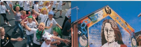
West Belfast Festival