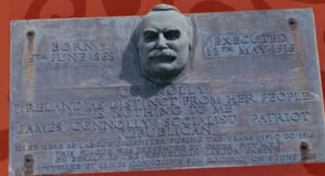
James Connolly Plaque, Falls Road

The Gaeltacht Quarter offers much to those who have an interest in the people and places that have shaped local history. James Connolly, Bobby Sands and O'Donovan Rossa will all become familiar to you. Visit Clonard Monastery where sensitive negotiations helped in the search for peace in the city.